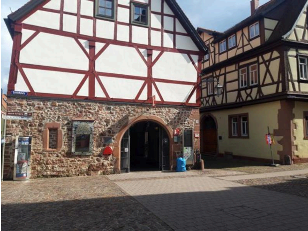
Tourist Information Lohr am Main