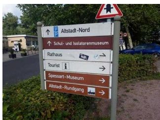
Visual tactile design