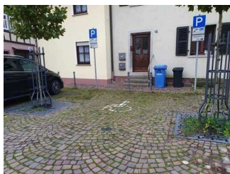
Parking lot for people with disabilities

We have put together some photos from the company / offer for you. You can find more photos in the detailed reports.