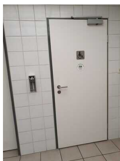
Public WC for people with disabilities in the underground car park, floor 5