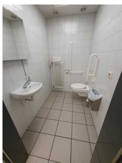
Public WC for people with disabilities in the underground car park, floor 5