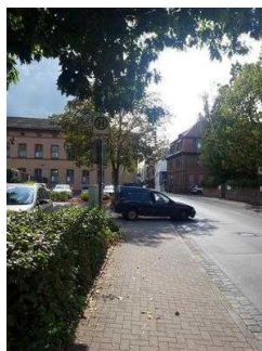
Bus stop hospital