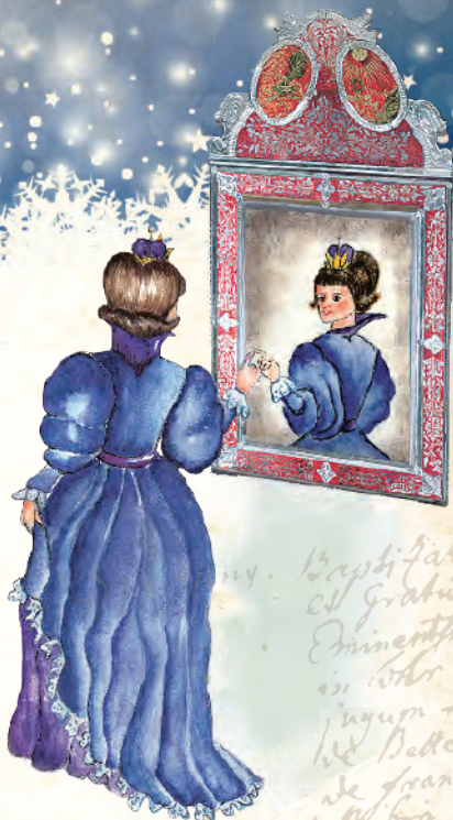
Entry in parochial register in Lohr recording Snow White's birth:

Baptisato St. Maria. Bp et Gratiosi Dni Dni p. h. Eminentissimi abbas. Bp in Lohr et Gratiosi Dni jugum filio. Levant. Bp de Bettendorf nata (Bm) de Frankenstein nata St. Katharina nata de P. h. d.