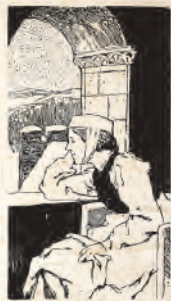
Snow White's mother.